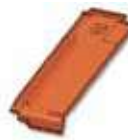
51 MO Left 1/2 tile Montchanin/ 3 per l.m. / 1.65 kg