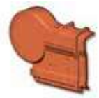
27 XL Right overlapping universal ridge end / 3.3 kg