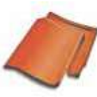
3 MY 1/2 gauge tile Mercurey / 4 per l.m. / 2.65 kg