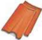
613 MY Ventilation tile / 5 kg