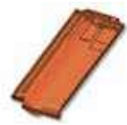
5 XLD ** 1/2 tile / 1.3 per l.m. / 2.4 kg