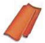
5 MG 1/2 tile Montagny / 1.2 per l.m. / 2.5 kg