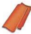
5 MY 1/2 tile Mercurey / 2.5 per l.m. / 3.1 kg