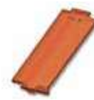
5 XLQ*** 1/2 tile / 3 per l.m. / 1.6 kg