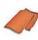
25 MY 1/2 gauge 1/2 tile / 1.6 kg